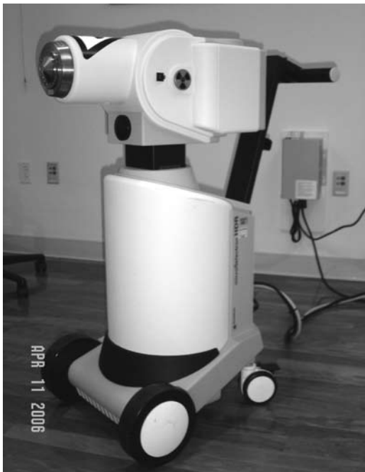
Figure 2: A side view of the High Dose Rate Machine

Brachytherapy refers to a method of delivering ionizing radiation by placing radioactive sources either directly into the cancer or very close to it. These sources are typically encapsulated in small individual seeds for permanent prostate implants (seeds) or attached to a long wire for high dose rate (HDR) brachytherapy . One of the most important properties of brachytherapy treatment is the ability to deliver a very highly focused dose to the cancer. The cancer cell killing effects of the radioactive source drop off rapidly with increased distance (millimeters) from the source. Delivering a high dose at very close range minimizes the radiation received by surrounding normal tissues. For treating prostate cancer either type of brachytherapy may be used alone or with EBRT, and with or without hormone therapy (androgen deprivation). Typically brachytherapy is used alone for localized cancers (cancer with a low stage and Gleason score) and used with EBRT for more advanced cancers.